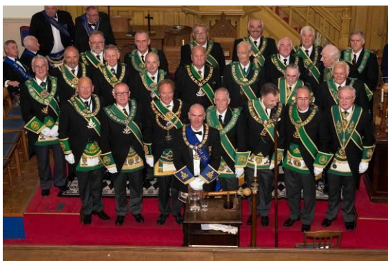
Provincial Grand Masters from 19 different Provinces who took part in the Entered Apprentice degree conferred upon the son of the Right Worshipful Master of Lodge Thistle and Bruce, Bannockburn on Friday 20 th June 2014. The event took place in the Allen Church, Bannockburn.