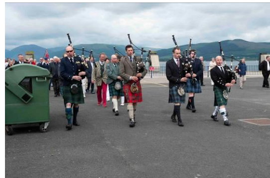
Pipers leading the parade of passengers from the Waverley to Lodge Rothesay St. John No. 292 on their arrival in the town.