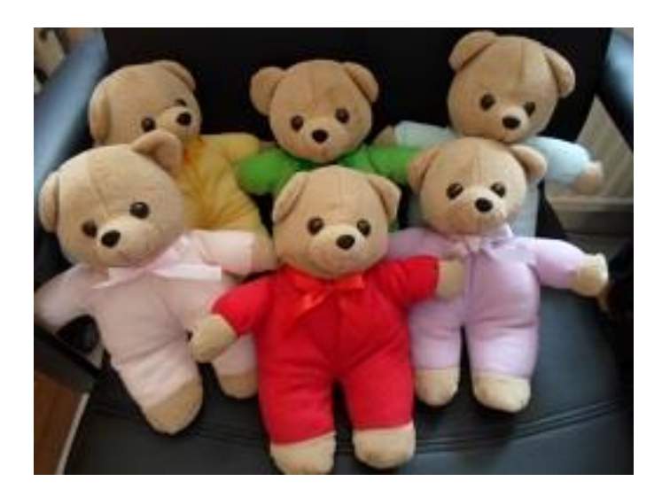
Not Broxi Bears but TLC bears - part of the first delivery to IRH.

For some time, we have been trying to build up some funds in a new Provincial Grand Master's charity fund and having now managed to bring the total to an acceptable level where we can start dispensing some of the proceeds, (some monies were released as a donation to the Nepal Earthquake Appeal), I am pleased to announce the first project.