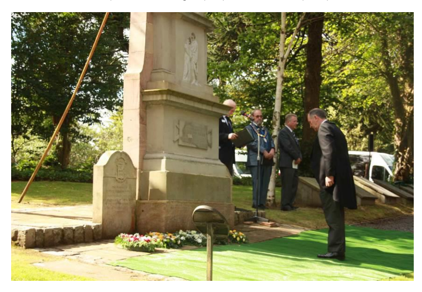
A wreath was laid on behalf of the freemasons of the Province.