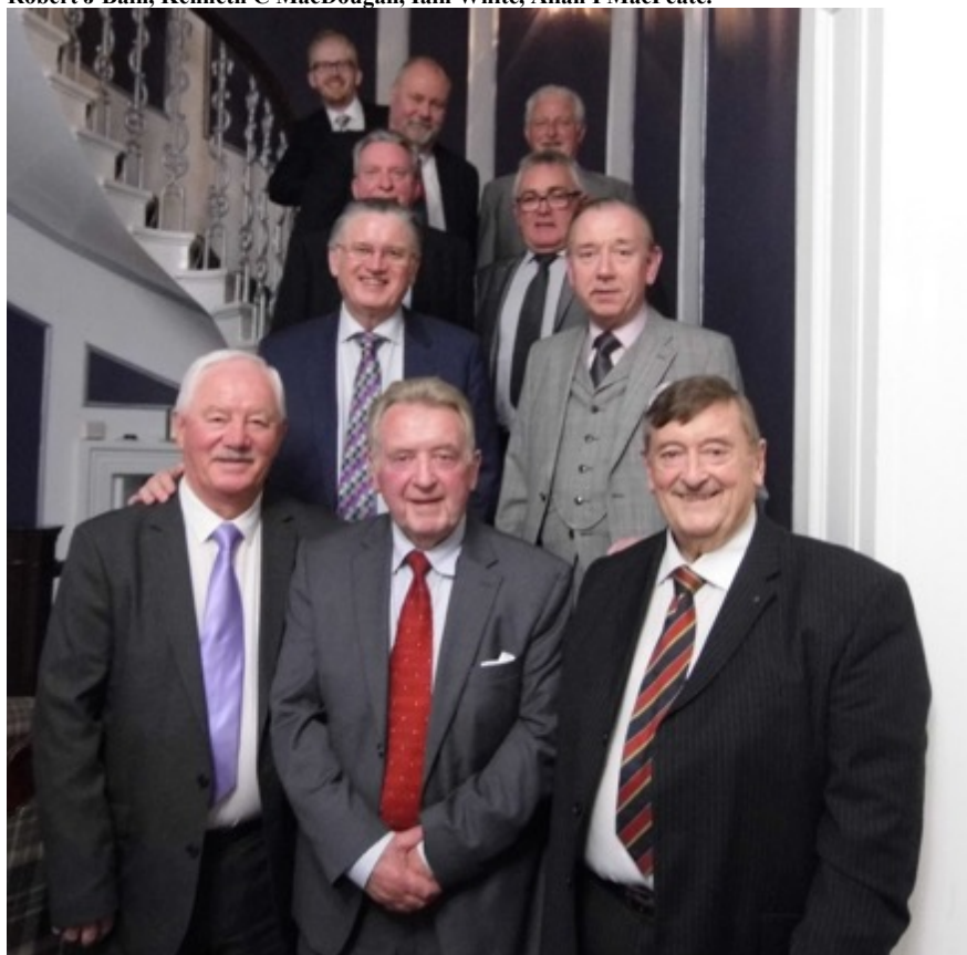
The Photie taken at ALL Tontine Dinners – on the stairs! The senior men have their rightful places at the front!!