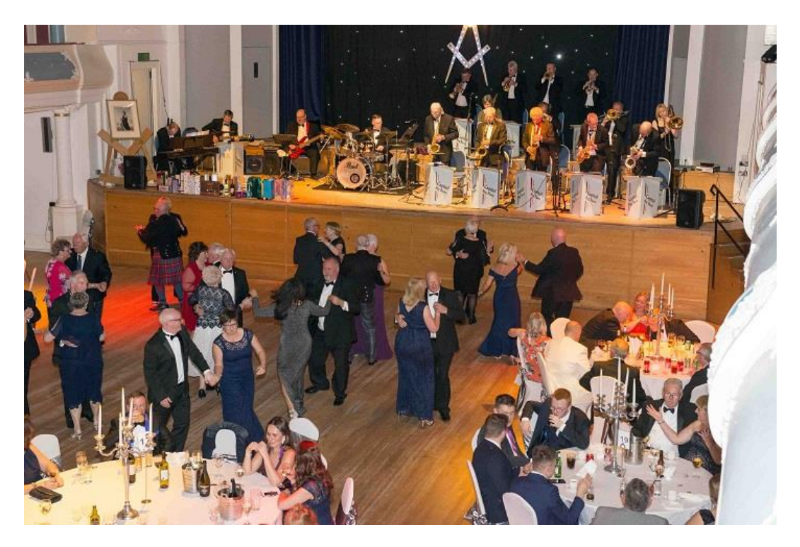
Meal over and the guests taking advantage of the great sounds of the Capitol Big Band.