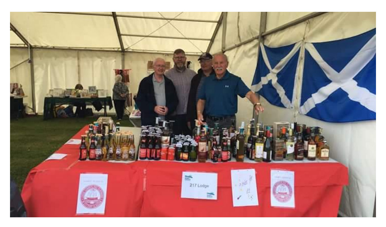
Members of Lodge Cumberland Kilwinning No. 217 with the customary Bottle Stall organised by the Lodge at Port Glasgow's Comet Festival .