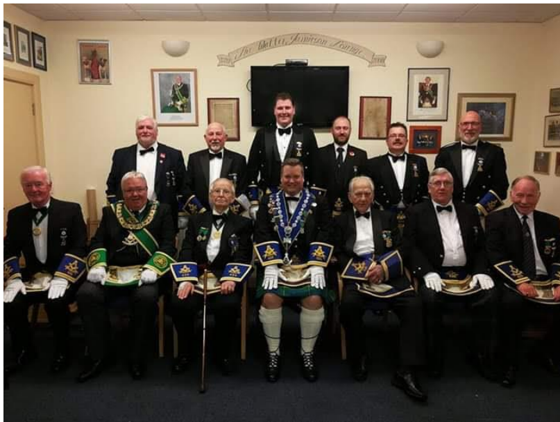
The newly installed Master of Lodge Firth of Clyde, Gourrock No. 626 along with his line-up of Past Masters at the annual installation on Saturday 13 th October 2018.

At the Regular Meeting of the Lodge on Monday 22 nd October, the Lodge approved a donation to PoppyScotland of £626.