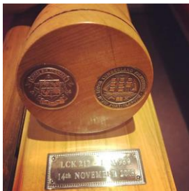
A detailed photograph of the new gavel presented by Lodge Cumberland Kilwinning No. 217 on the occasion of their visit to Lodge Sir Michael No. 989.