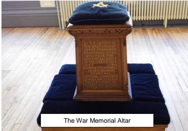
The War Memorial Altar