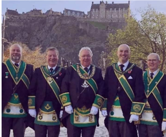
The Commission on an awayday or as alternatively titled, 'Five go mad in Edinburgh'!