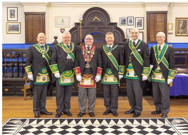
A full supporting cast of Commissioned Office-bearers from the Provincial Grand Lodge of Renfrewshire West at the annual Installation of Lodge Cumberland Kilwinning No. 217.