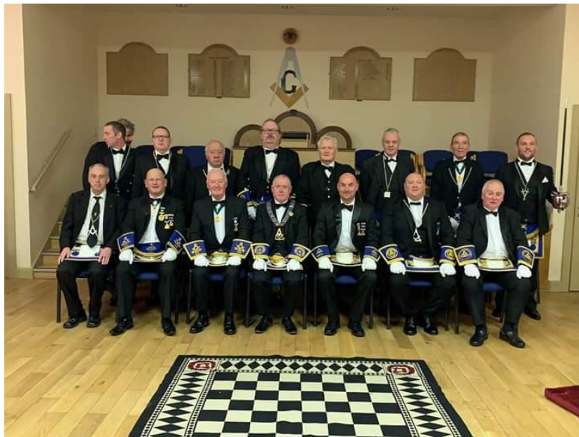
The Master, Installing Masters and office-bearers of Lodge Inverkip Ardgowan No. 1425 for session 2018 – 2019.