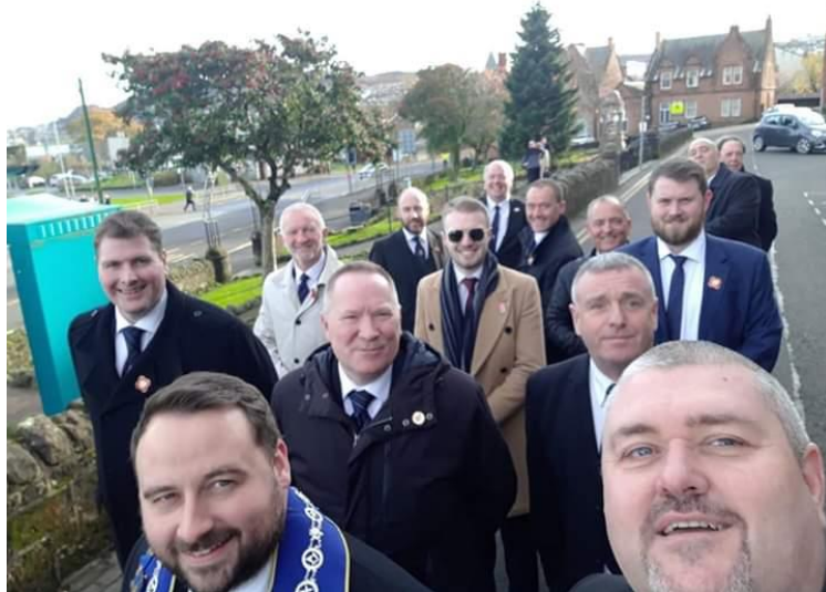
Members of Lodge Firth of Clyde, Gourrock No. 626 join the parade from the Church to the cenotaph at Gourrock.