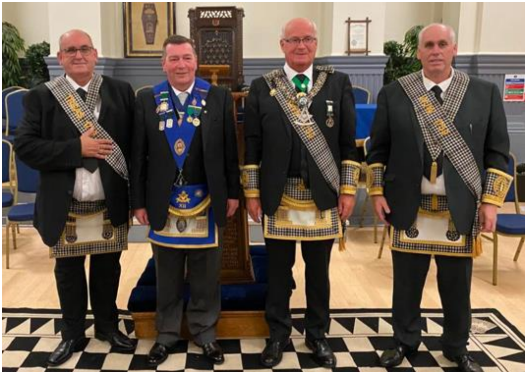
RWM and the Deputation of our friends from Lodge Burns Dundonald No 1759