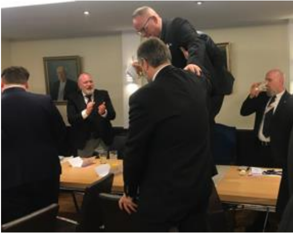
Traditional German Toast – on the tabletop