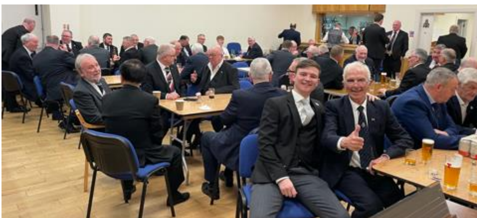
Big crowd of brethren at the post meeting hospitality enjoying themselves interacting with brethren from their own and sister lodges – happy days

After the meeting, the vast majority of those present stayed behind for some hospitality and a blether. It was great to see the brethren mixing informally and enjoying each other's company. There was much laughter.