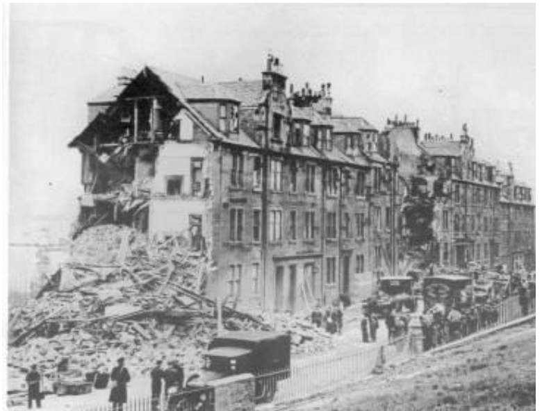
Belville Street Devastation

This item brought some interesting feedback from some of our readers.