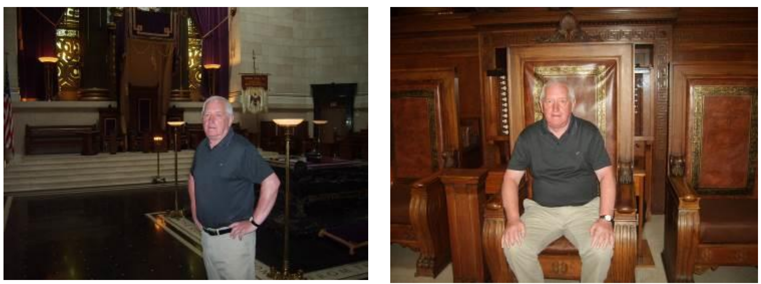
More information and photos from Bro Jim will follow in a subsequent edition