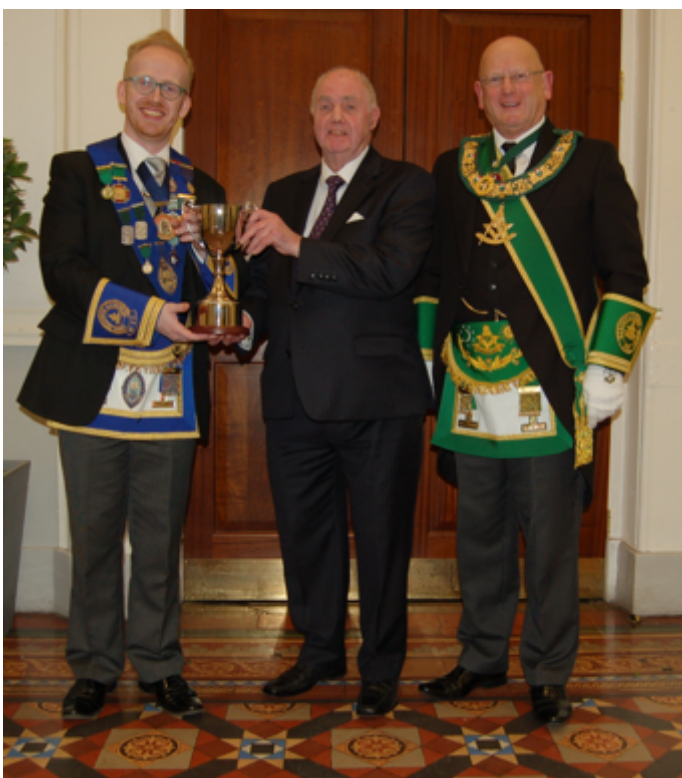
The presentation of the Wilson J McCulloch Trophy