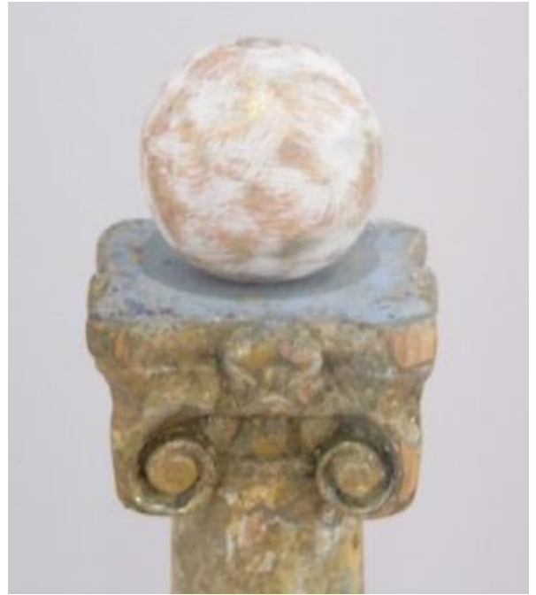
Just some more cleaning and TLC