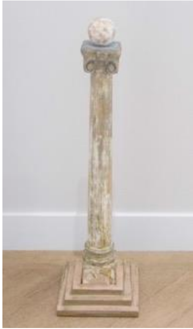
Nearly ready for primer