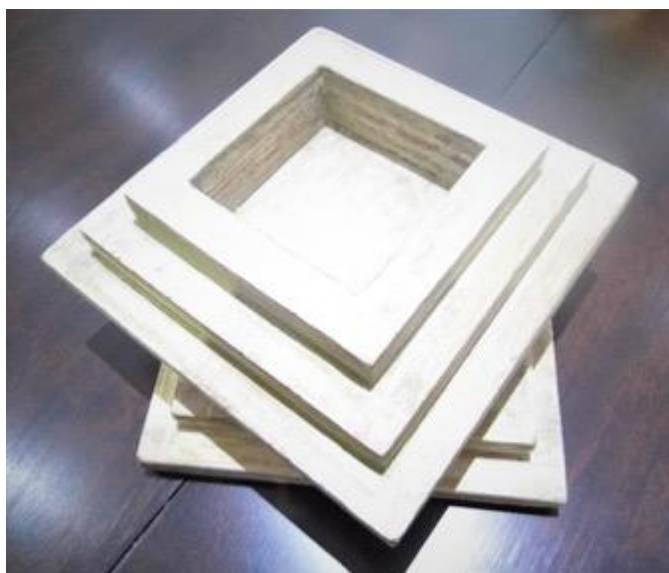
The bases are stripped ready for coating