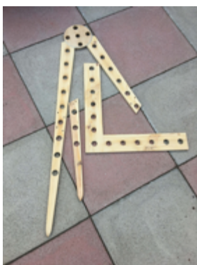
Stage 2 Sanded the Square and Compasses to remove all the old paint – 13 th April 2020

Stage 3 Repair the damaged leg by inserting metal plates to connect securely back to the main body – mid July 2020