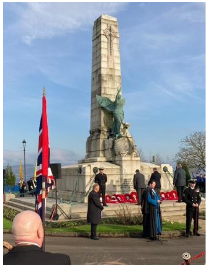
Right: The RWMs lay the wreaths