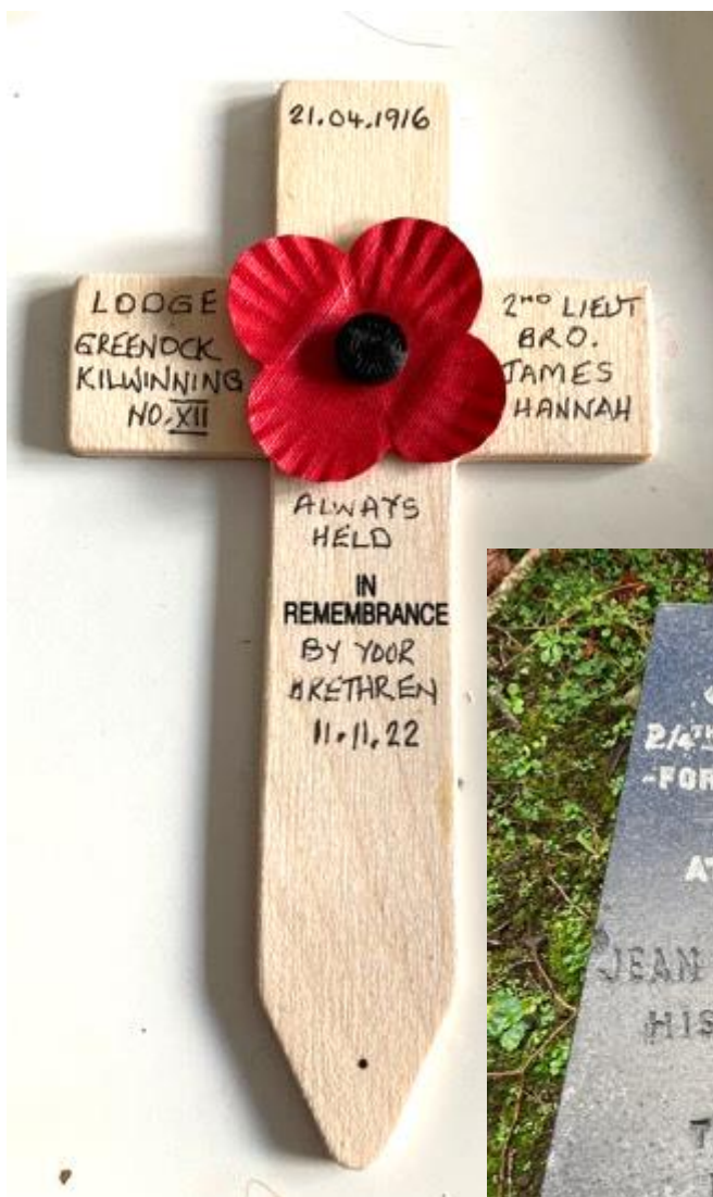
The Poppy Cross

After the silence, I played The Dark Island on the pipes, a lovely slow air which happens to be the favourite pipe tune of our RW Master.