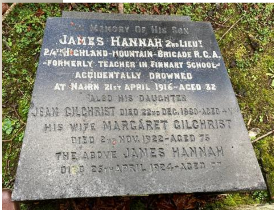
The Memorial Stone