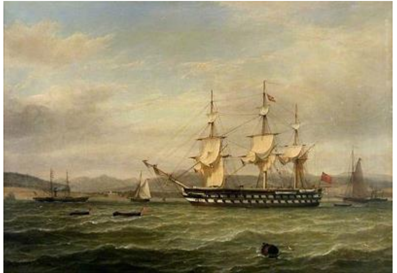
HMS La Hogue