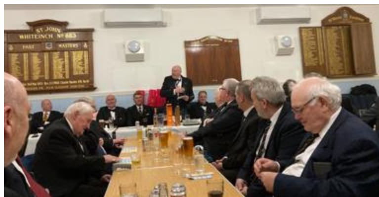
A few words from the Master