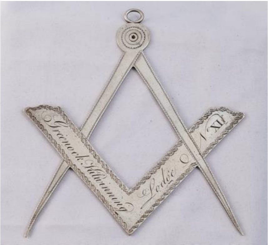
Another solid silver jewel, this time looking like that of the Depute Master. Again, this dates to when the Lodge was No. XI but close inspection will let you see that some 'amateur jeweller' has tried to add an additional Roman I to the right of the XI. What on earth possesses people to do things like this?