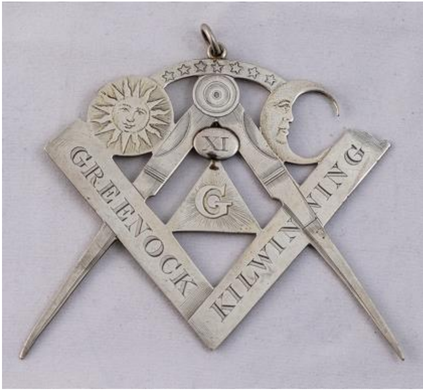
A Master's jewel dating from the time that the Lodge was No. XI. It is ornate and solid silver