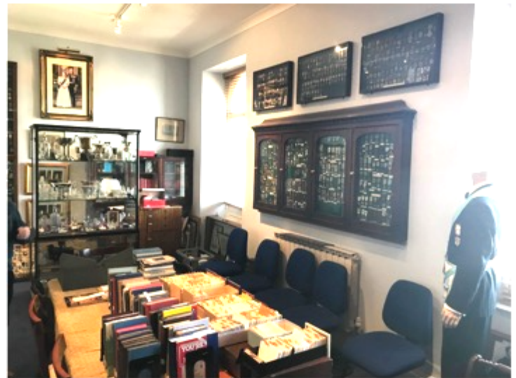
Jersey Masonic Museum