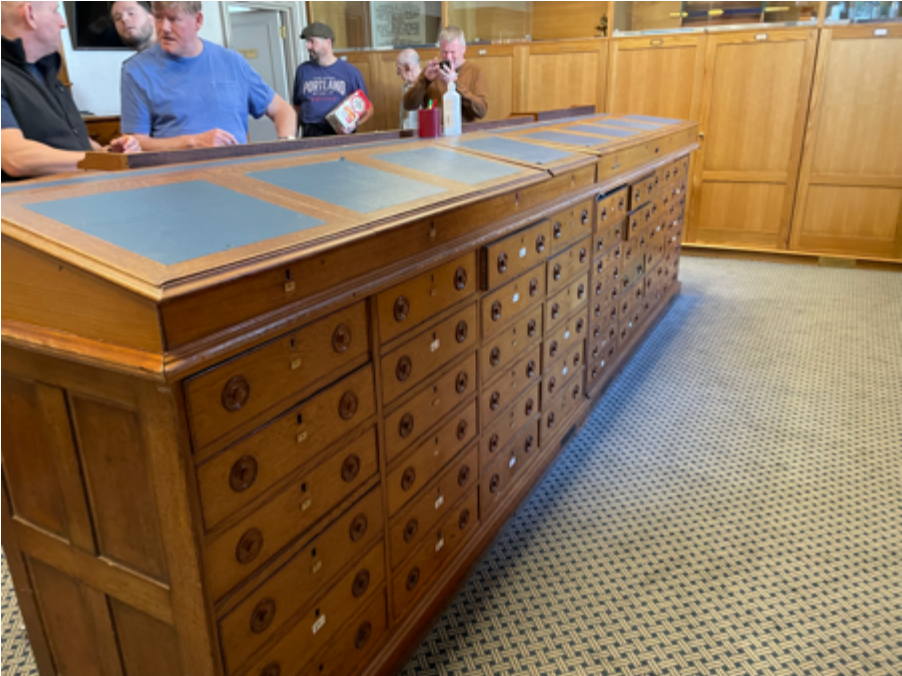
The Temple anteroom today, where regalia is still stored, after restoration