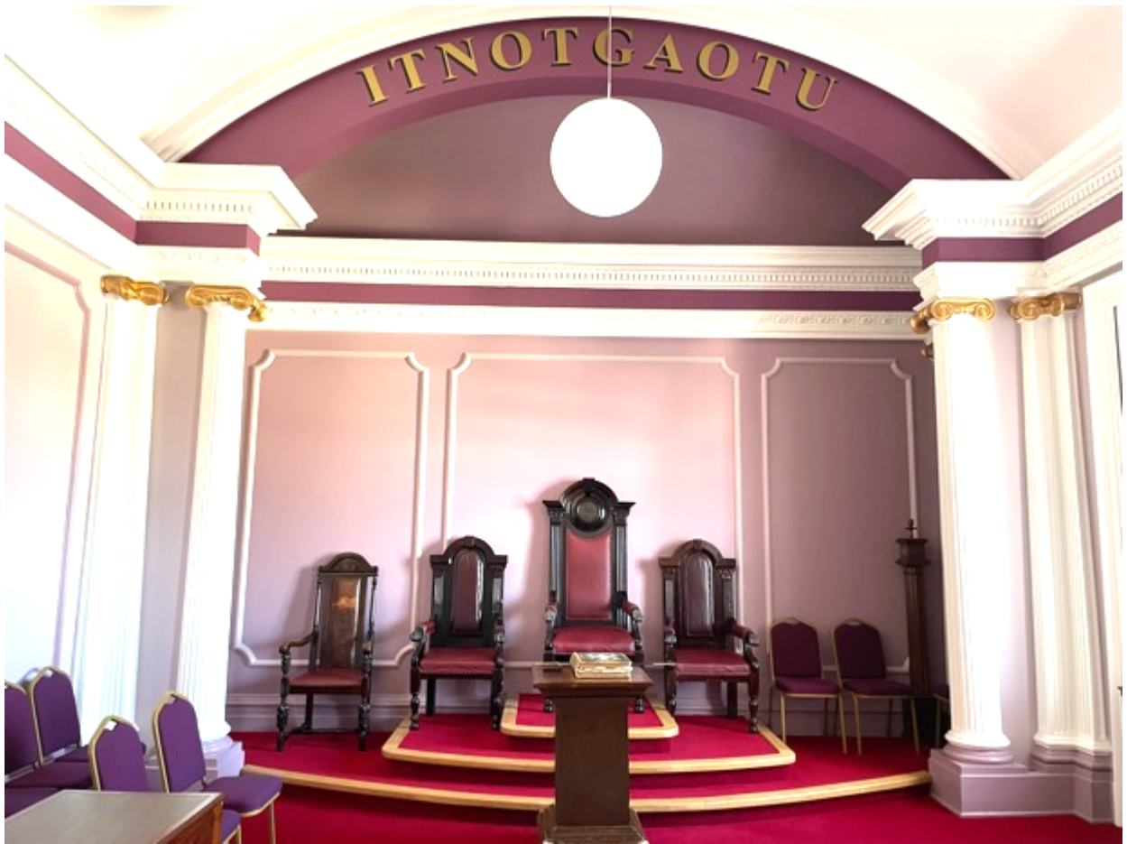
The magnificent practice room which probably has a capacity of around 30 and is occasionally used for small meetings.