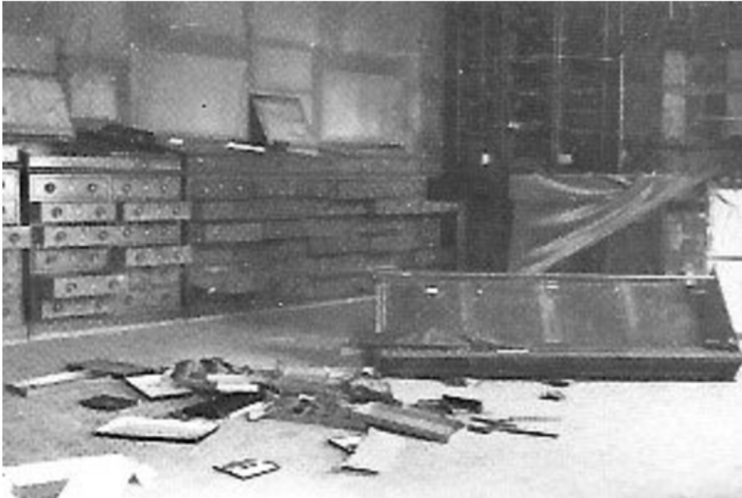
The Temple anteroom, where regalia is stored, after being ransacked by the Germans in 1941