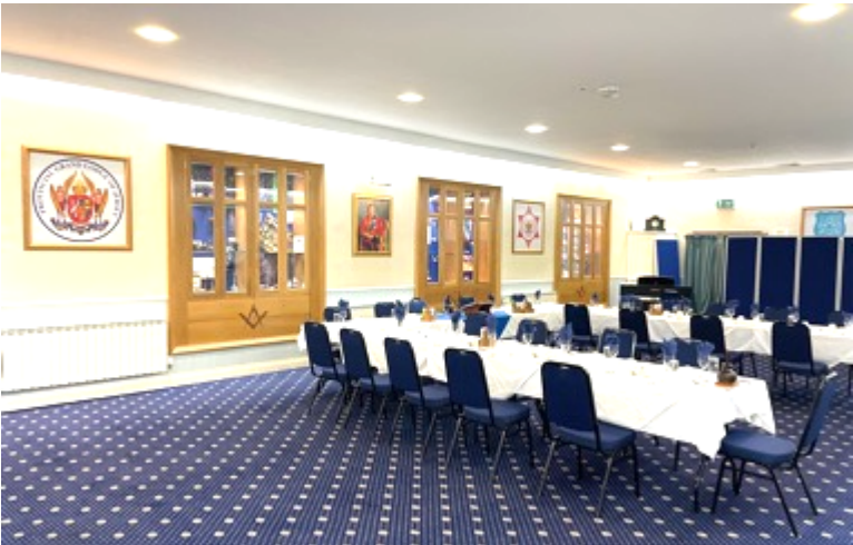
Jersey Masonic Temple Function Room – set out for a small dinner