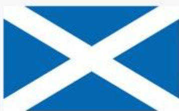
Flag of Scotland

also known as St Andrew's Cross or The Saltire