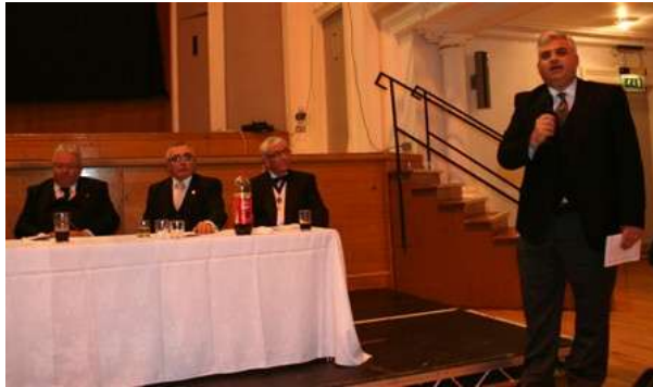
Toast to the Visitors....