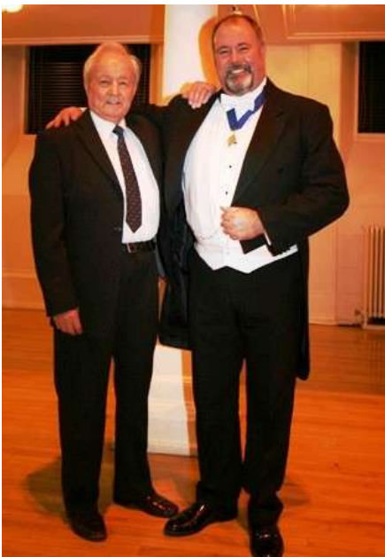
Father and Son