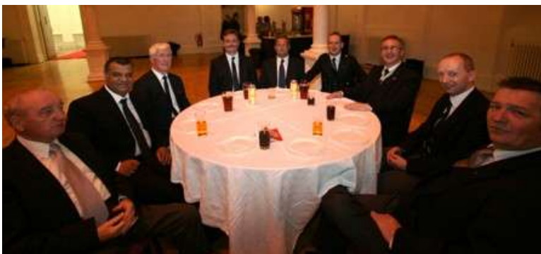
XII and 175