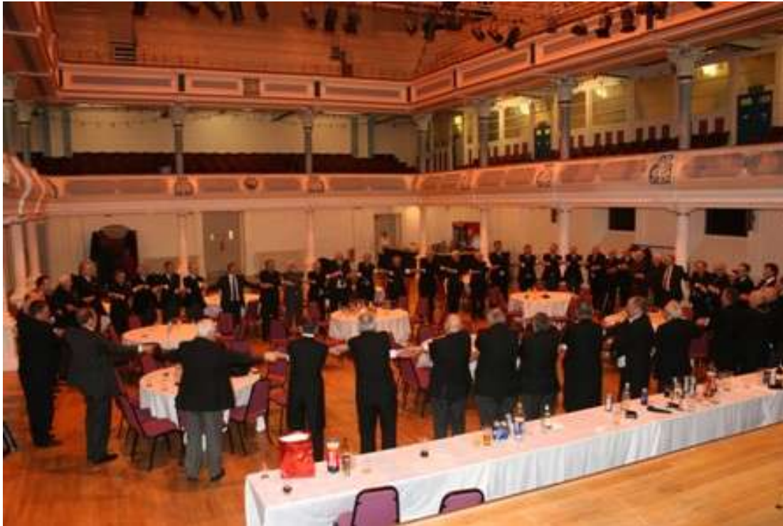
The Brethren sing Auld Lang Syne

The extremely happy evening finished with the singing of Auld Lang Syne and three hearty cheers!