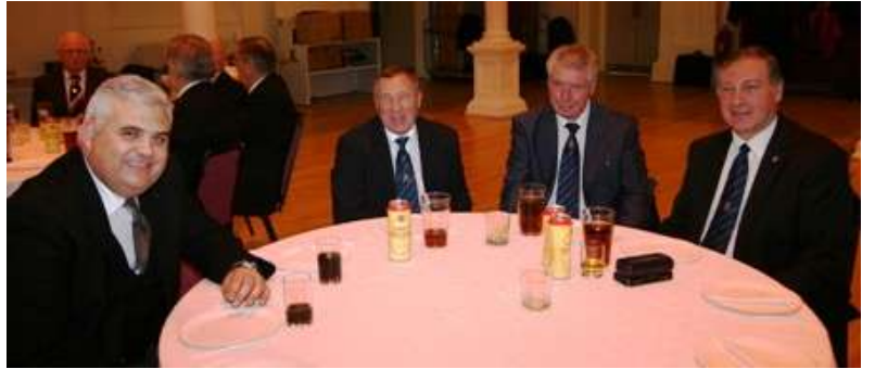
St John's Whiteinch 683