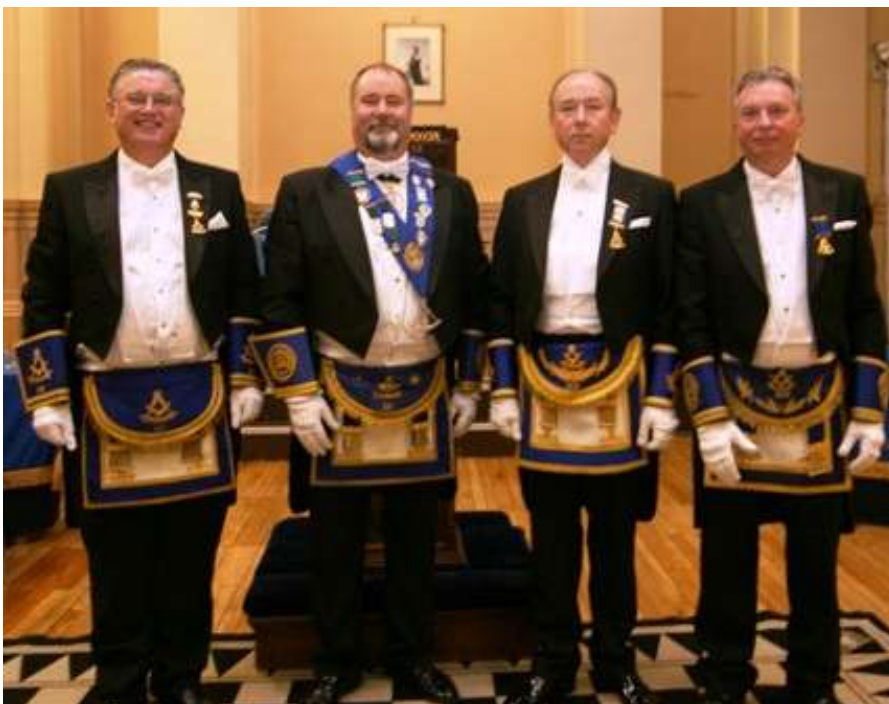
The new RWM and his Installing Masters