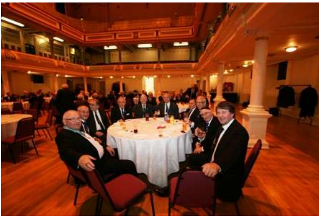
Shalom No 1600