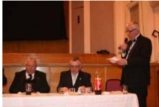
and the reply