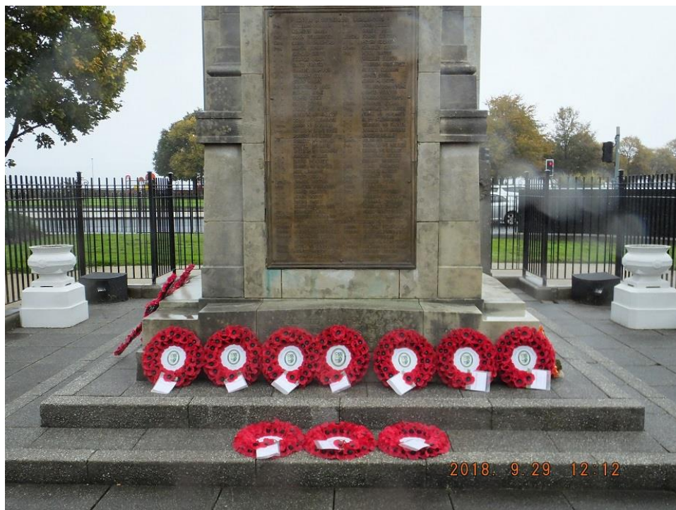
Wreaths laid following a very moving ceremony at the Port Glasgow Cenotaph on Saturday 29 th September 2018.