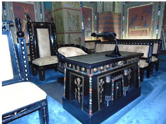
A view of the very ornate Master's chair and dias within the building