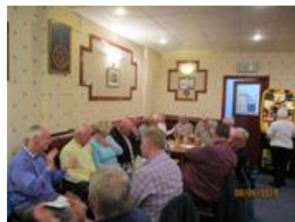
Lodge St John's 292