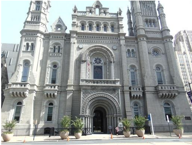
Photo shows the front view of the Grand Lodge building in Pennsylvania in the Grand Old United States of America