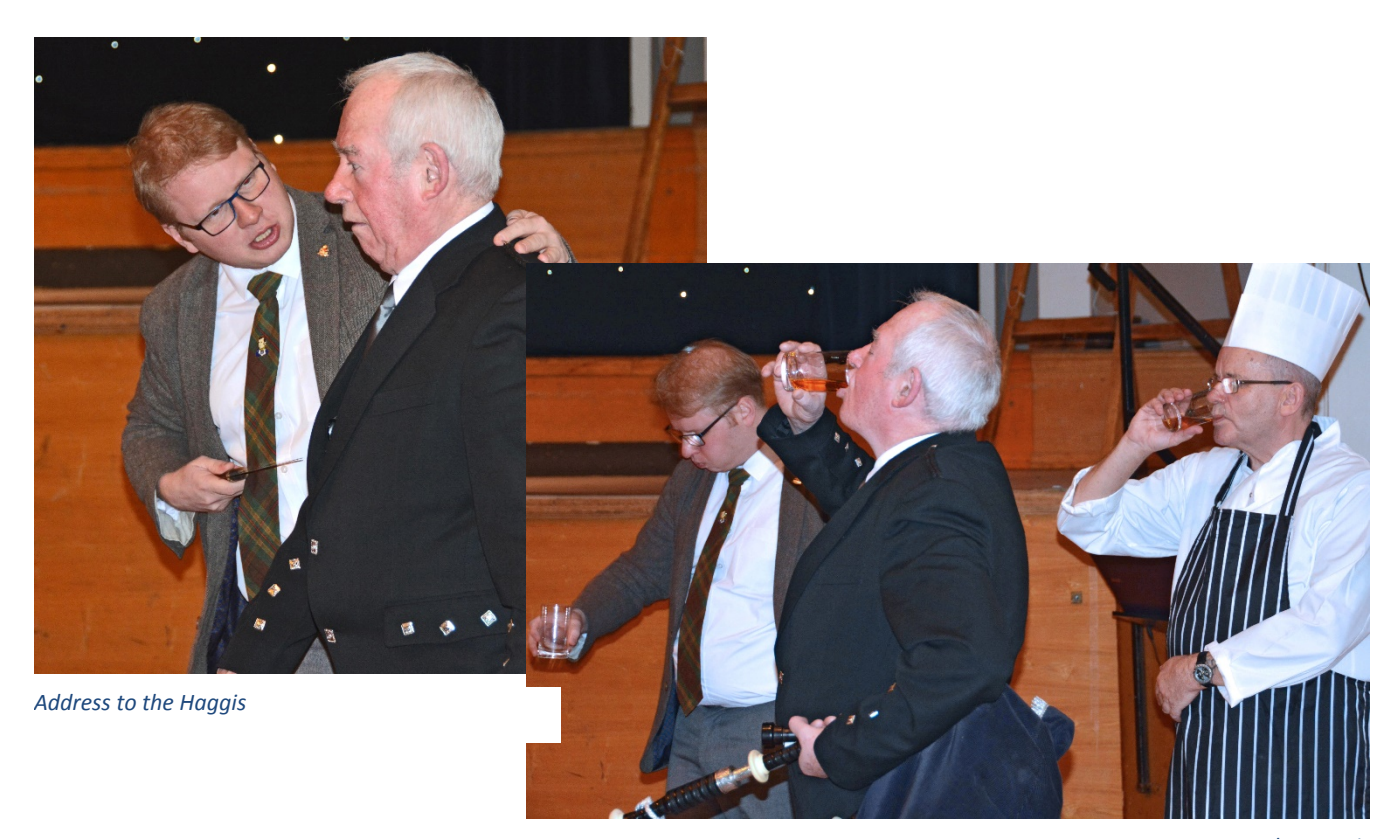
Toast to the Haggis