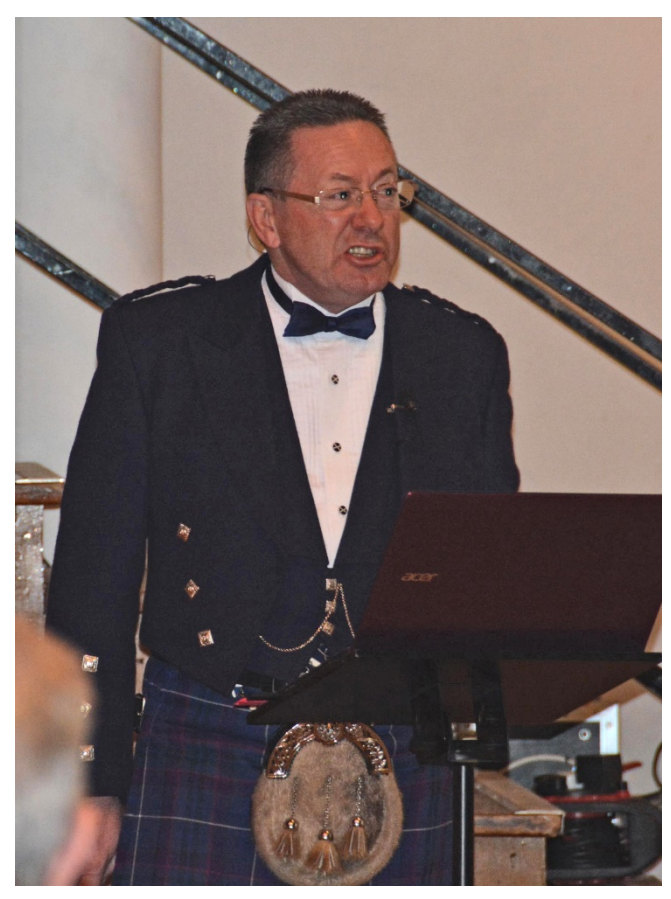
The immortal Memory