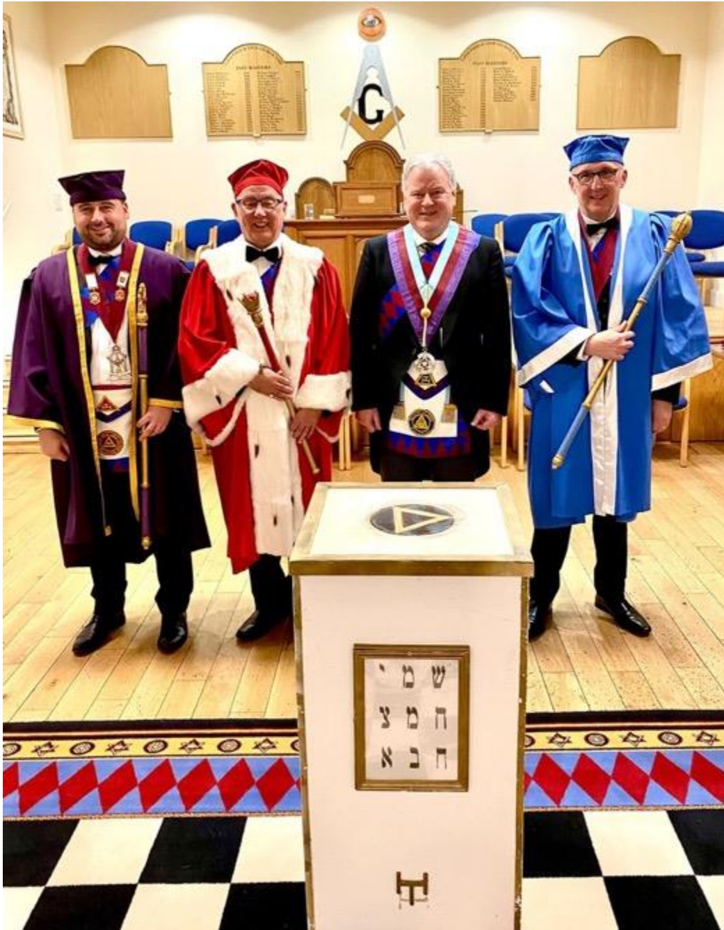
The Installation at RAC No. XVII