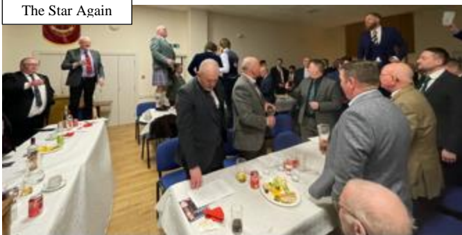
The Star Again