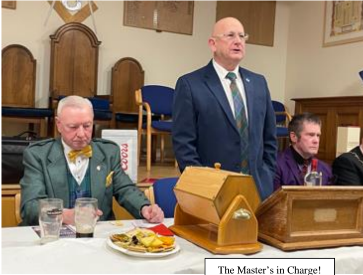
The Master's in Charge!